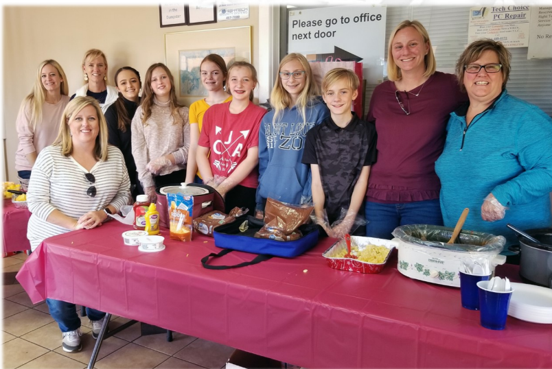
The Sisters of Service from St. Joseph's Cottleville serving at the Economy Inn, October 26.

The calendar is always available online at firststepbackhome.net/meal-calendar . Contact Kim Orf to sign up for serving meals. (contact info is on Page 1).