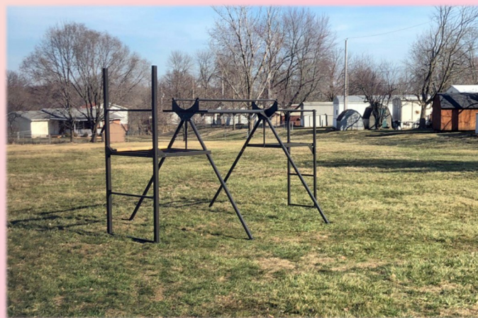
Project status at the end of the first day.