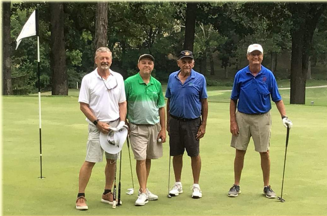
FSBH Foursome Team

At the end of the day, FSBH was presented with a $17,500 check of proceeds from the event, plus more to come later, the organizers said, from the silent auction funds. All of the tournament winners donated back their winnings, and caddies/servers also donated back their tips for the day. Such a humbling experience for all of us from FSBH !